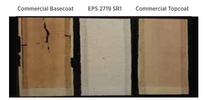
QUVA Accelerated Testing