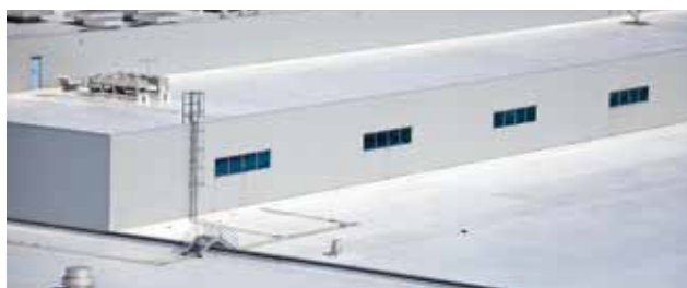
Commercial Basecoat EPS 2719 SR1 Commercial Topcoat

High-performance coatings are an integral part of your roofing system. As a leader in the architectural, industrial, construction and adhesive markets, Engineered Polymer Solutions (EPS) develops and delivers technology to help you stay proactive and enhance the durability of your roof coatings. As your first line of defense, EPS resins can be formulated to protect against chemical and environmental stresses.