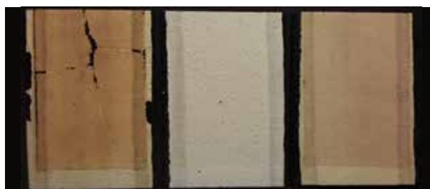
QUVA Accelerated Testing